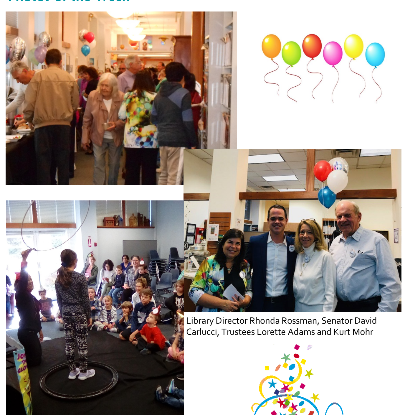
The West Nyack Free Library has been a cornerstone for its community for 60 years. On Saturday, October 12 they hosted a Children's Party for 50 people. Party in the Stacks , attended by over 300 people, was celebrated on Monday, October 14.

Share a library-related photo, include a brief caption, your name, position and the library's name. A photo release is required from recognizable individuals in the photo. <u>Click here</u> for the RCLS photo release. Submit the picture to <u>rclsmemo@rcls.org</u> with 'Photo of the Week' in the subject line.